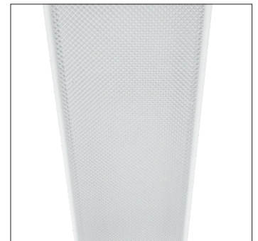
MP19H microprismatic diffusor